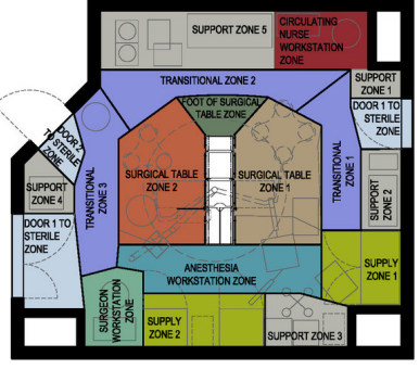
OR 2 CLEAR AREA: 462.75sf