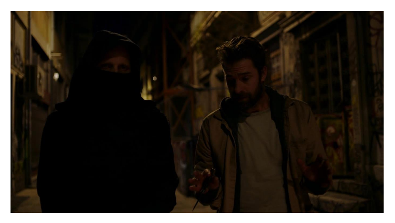
Figure 4: Saul Preforms the Trans Body in Public

the body—in order to secure its status as legitimate text coming from the medium of film, which will impact other cultural discourses, including academia, through its use of filmic forms.