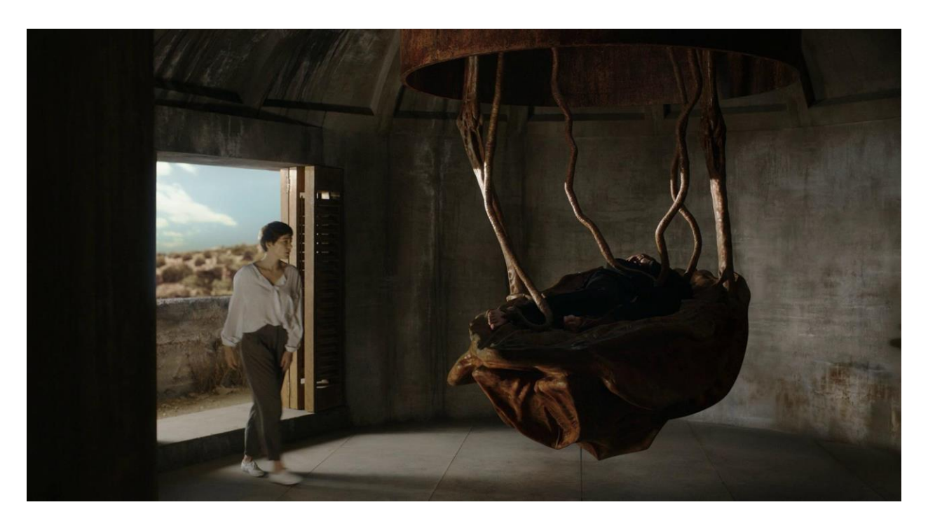
Figure 1: Caprice enters Saul's chamber to wake him, with his body still inside the LifeFormWare bed